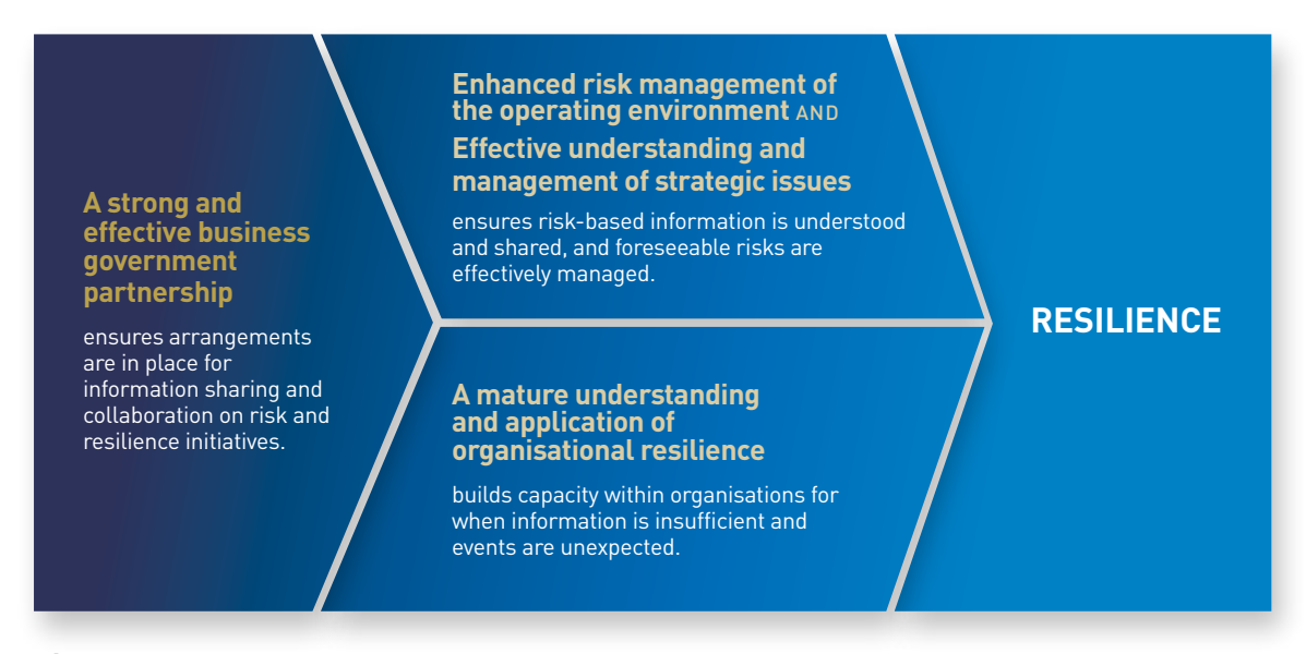
Figure 1: The four key outcomes that contribute to overall resilience

Four key outcomes will be delivered through the Critical Infrastructure Resilience Strategy. These outcomes work together to build overall critical infrastructure resilience.